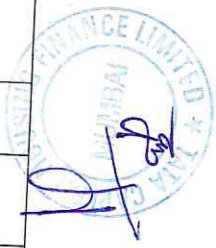
Table III - Statement showing shareholding pattern of the Public shareholder: Nil Table IV - Statement showing shareholding pattern of the Non-Promoter- Non-Public shareholder: Nil